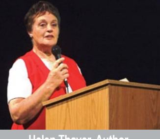
Helen Thayer, Author Polar Dream

The Garfield County Libraries completed a 10 week program of encouraging children to read and use the library during the summer of 2006. Using the multi-state collaborative theme "Paws Claws Scales and Tales", all six libraries in the Garfield County Public Library System provided special programming that was free and open to the public.